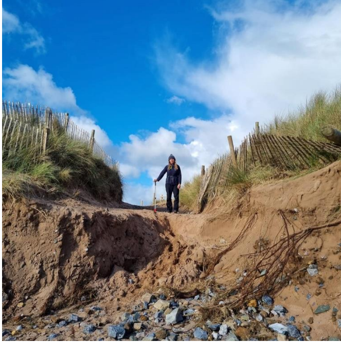
Figure 7. Storm damage/erosion at Dawlish Warren NNR.