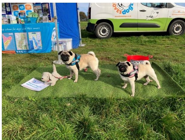
Photo 3: Pop up at Dawlish Countryside Park Saturday 11 th November.

3.5 As well as walks, I've also been out with the gazebo doing pop ups, at the Exmouth Wildlife Refuge, Dawlish Countryside Park and on the Otter Estuary. Although the Otter isn't currently part of our remit, it was a hugely successful pop up as we were able to meet a high number of dog walkers in a short space of time, many of whom are also regular visitors to the Pebblebed Heaths. We were also able to easily share information about the Exe Estuary as the species that the Exe is protected for are similar to those expected to share the Otter now and in the future.