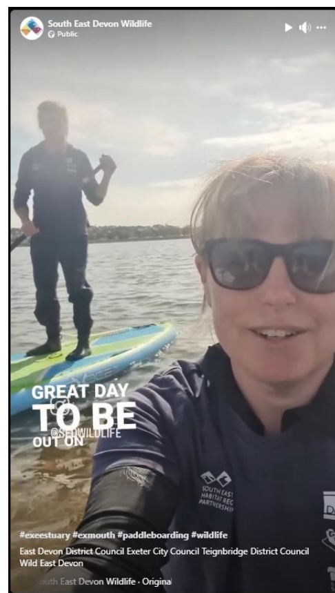
Figure 2. Social media post – paddleboard refuge patrol.

This was a busy weekend at the Duck Pond with the temperatures still feeling summer warmth and lots of watersports enthusiasts launching from Imperial slip way – lots of interactions and spent the whole day at this site working from the gazebo.