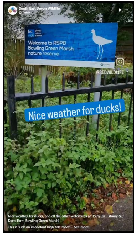
Figure 4. Informative post about RSPB Bowling Green Marsh.

Sat 21 st October was another busy weekend day at Exmouth Wildlife Refuge, with 40 interactions recorded. Sama and Katie also managed to squeeze in a heathland patrol in the morning, walking out of Warren car park.