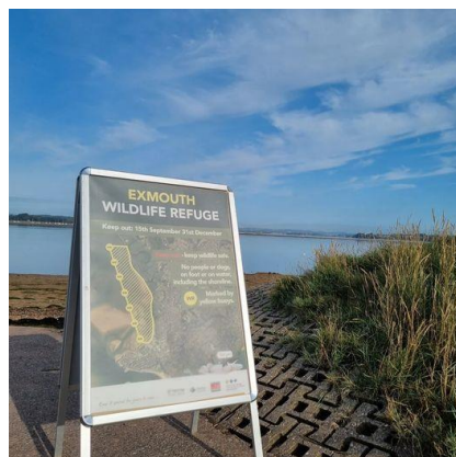
Figure 2. “A” frame signage, Exmouth Imperial Recreation Ground slipway.

Thurs 21 st Sept: Exmouth Wildlife Refuge pop-up. Great to open the season with (Pale-bellied) Brent geese feeding in the Refuge.