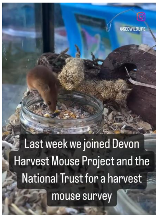
Figure 6. Harvest mouse survey, Exmouth.

Friday 3 rd Nov saw Sama and Imo working in partnership with the National Trust and Devon Harvest Mouse Project at Lower Halsdon Farm, Exmouth where they were providing a volunteer training session on harvest mouse surveying. This was a great opportunity for us to maintain important communication links between our project partners and introduce local volunteers to our messaging.