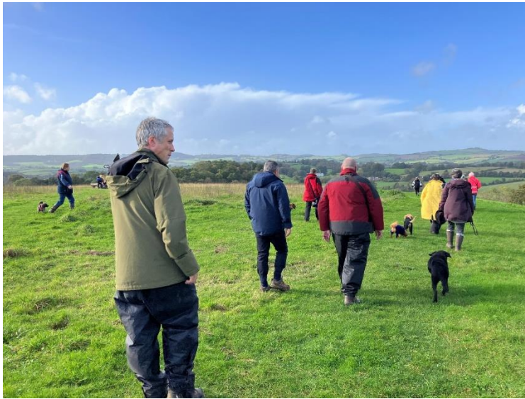
Photo1: Waggy Walk at Ridgetop 1 st November.