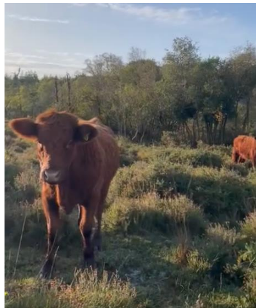
Figure 5. Heathland cattle (social media post raising awareness of management techniques).

Sat 21 st October was another busy weekend day at Exmouth Wildlife Refuge, with 40 interactions recorded. Sama and Katie also managed to squeeze in a heathland patrol in the morning, walking out of Warren car park.