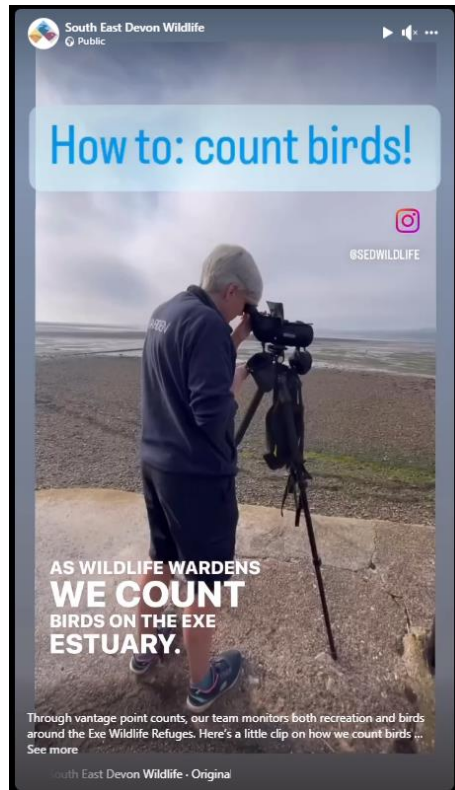
Figure 1. Vantage point count and social media post combined.

1.7 This year, there have been greater numbers of birds and species diversity in the Exmouth Refuge than any year previous. Initial Wetland Bird Survey (WeBS) counts of young Dark Bellied Brent Geese were concerning, at around 1.5% of flock size – nowhere near the 15% required to maintain a viable population. However, a second, more recent, WeBS survey resulted in a more reassuring count of approximately 19% young birds present.